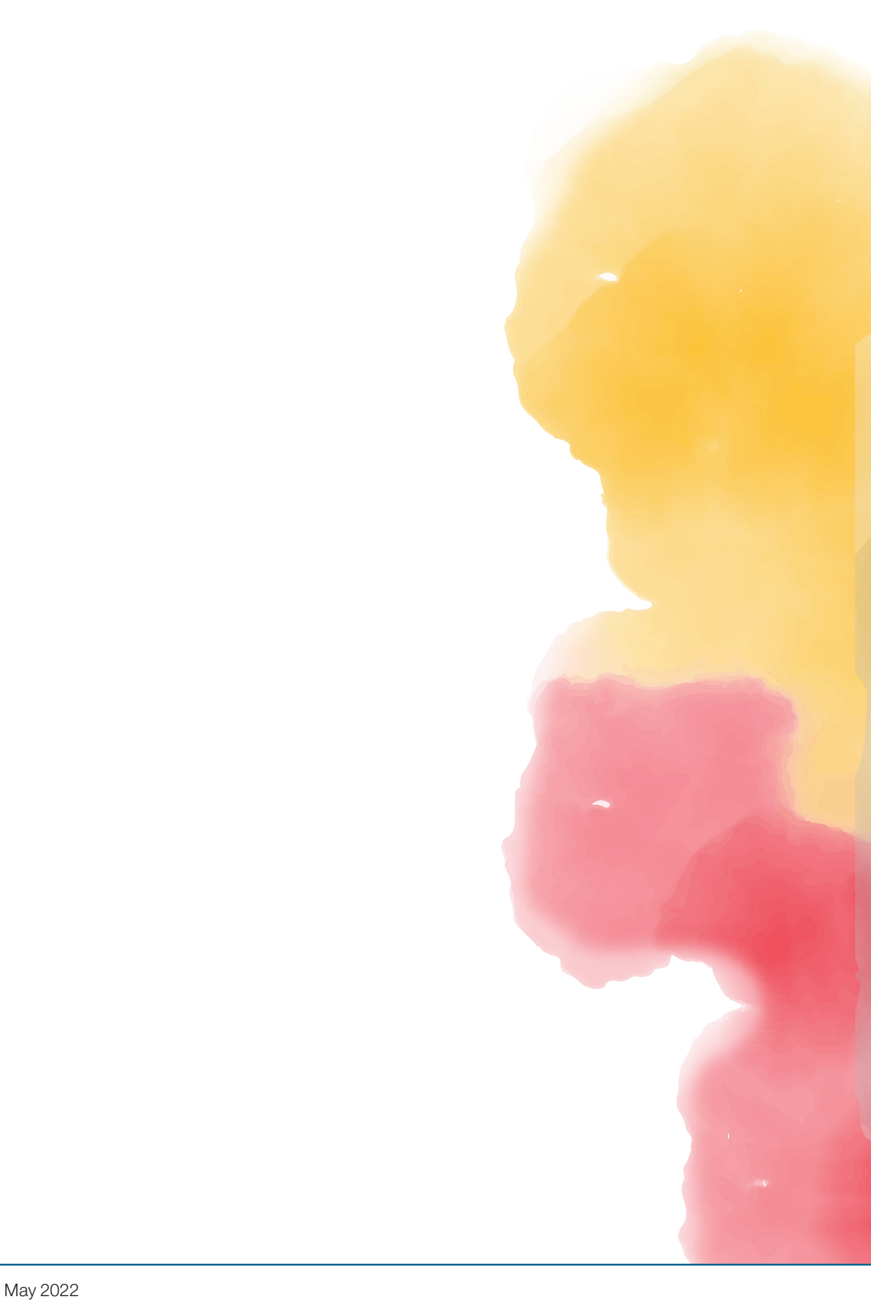
Copyright © Ashoka Deutschland gGmbH and McKinsey & Company, Inc. This work is licensed under a Creative Commons Attribution 4.0 International License (CC BY4.0, details: https://creativecommons.org/licenses/by/4.0/)